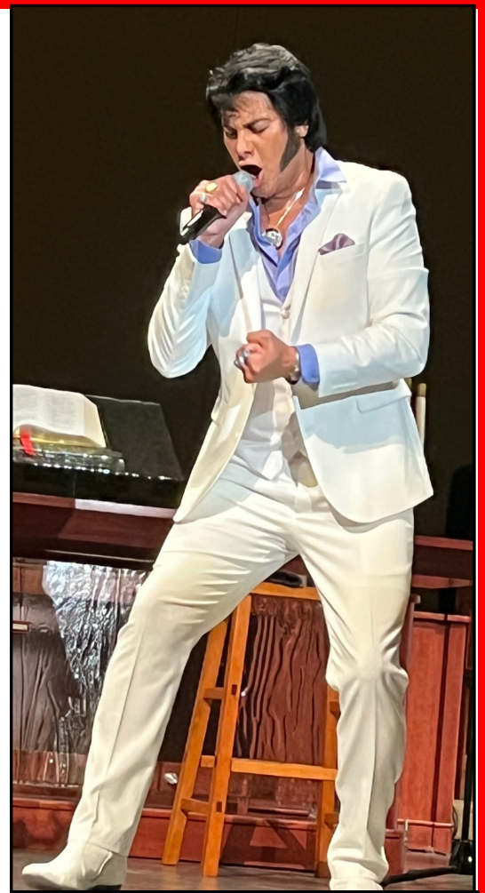
Hunk-a-Hunk o' Burnin' Love!