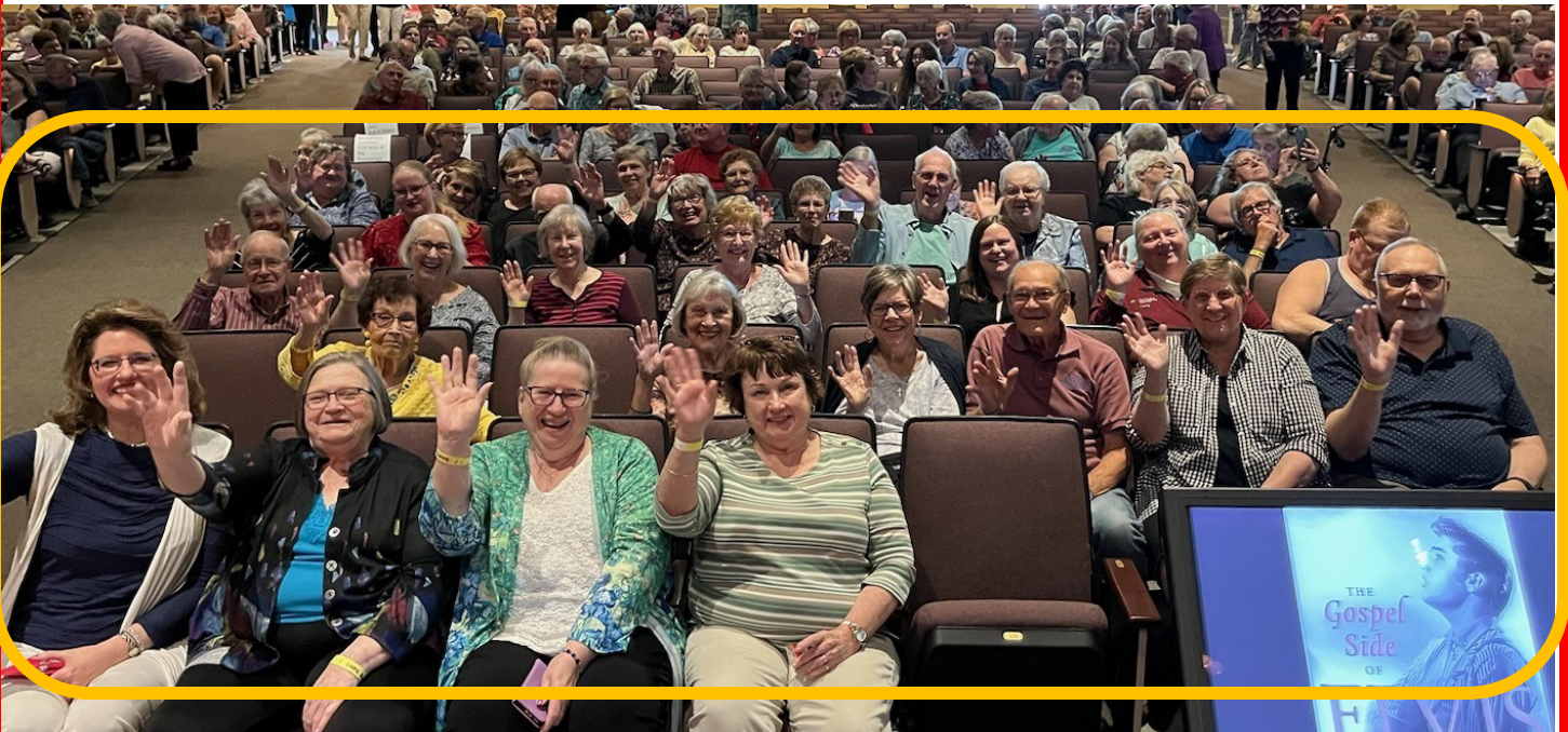
Look at those Attractive Folks from Southern Heights!