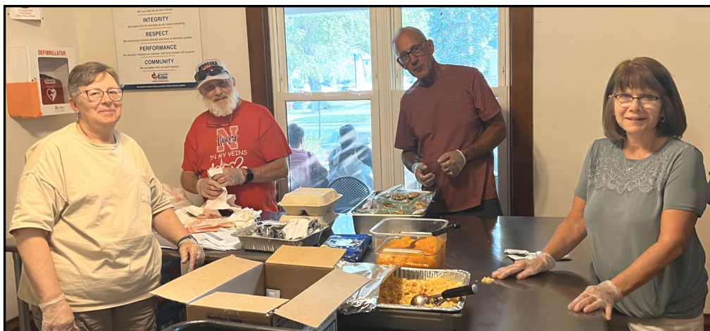
Serving at the Gathering Place

As we continue these programs, the only way they can continue to exist is through our giving, whether through our anticipated giving amounts made through our annual campaign or general giving. We urge you to use the anticipated giving option to help the financial stewardship committee plan our budget for the coming year as accurately as possible.