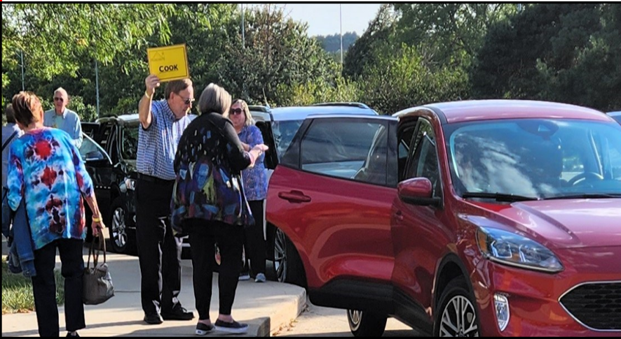
Chauffeurs gather their passengers for Caravan ride