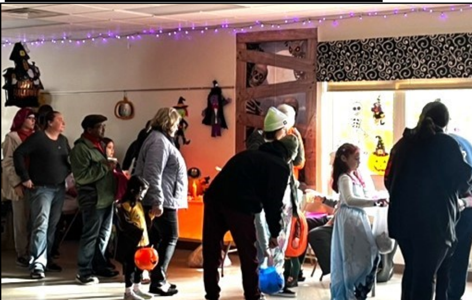
An estimated crowd of 250-300 came through, (120 kids)!