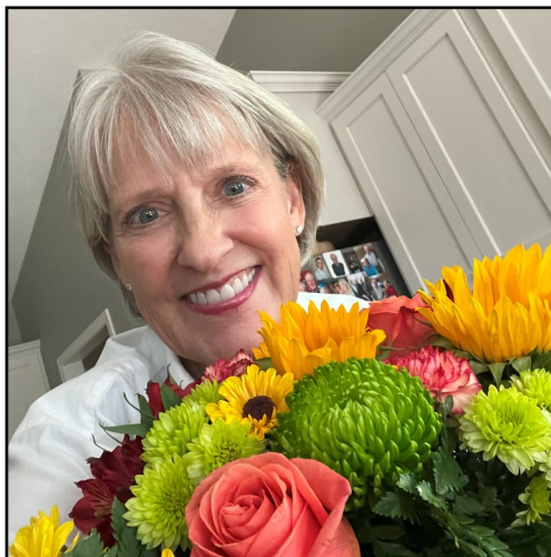
Flowers from fellow Deacons!

Thank you to everyone for your prayers, your love and support, your texts, your emails, your phone calls and cards!